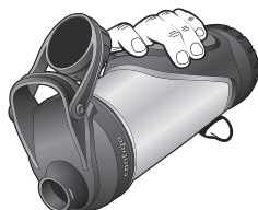
Ready to drink